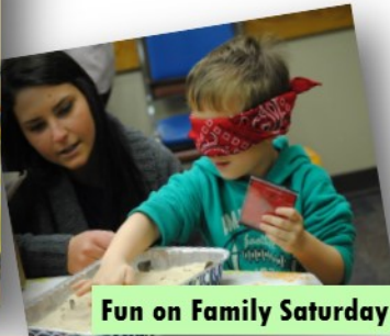
Fun on Family Saturday