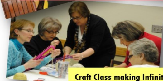
Craft Class making Infinity Scarfs

WE NEED YOUR HELP TO SUSTAIN THIS VALUABLE PROGRAM. PLEASE CONSIDER SPONSORING ONE OR MORE READERS.