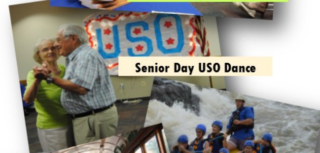
Senior Day USO Dance