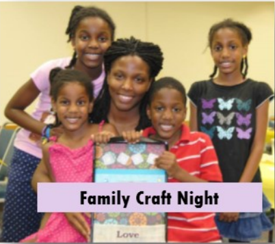
Family Craft Night