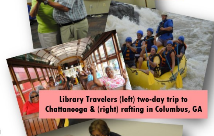
Library Travelers (left) two-day trip to Chattanooga & (right) rafting in Columbus, GA