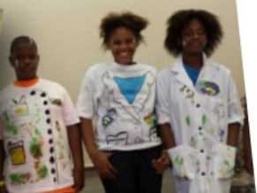
Mad Scientist Costume Contest at LaFayette Library