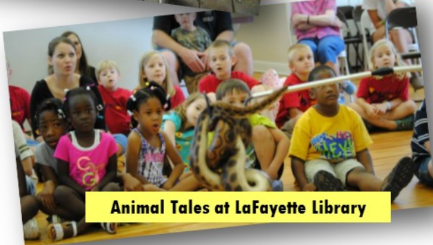
Animal Tales at LaFayette Library