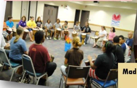
Teen Drum Circle at Bradshaw Library